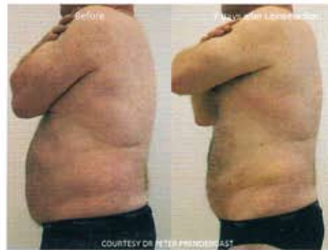
far left: before left: 7 days after LipoSelection