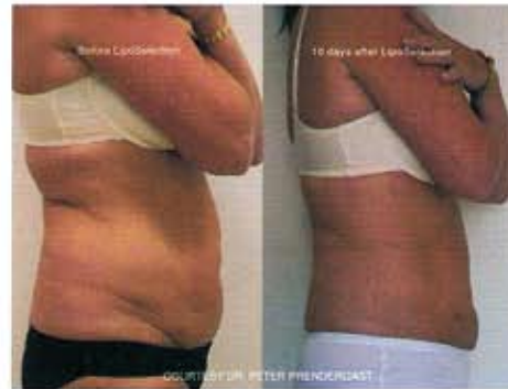
far left: before left: 10 days after LipoSelection