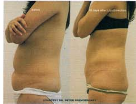
far left: before left: 19 days after LipoSelection

Patients who undergo VASER LipoSelection should expect to rest for the first 12 hours after surgery. After this initial period, patients should take it easy for the first week, resuming normal activities as they feel comfortable doing so. It is important to avoid strenuous activities and aerobic exercise for 2-3 weeks after the procedure, and to wear a compression garment for one month afterwards to help the skin to adjust and conform to the new body contours. Post-operative discomfort takes the form of deep muscle soreness and usually improves over 2-7 days. Bruising is normal and varies between individuals, though some patients experience no bruising at all.